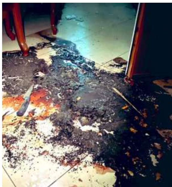
Bloodstained room in Kibbutz Be'eri, Southern Israel.

In short, what Hamas is carrying out is a triple war crime: using civilians in Gaza as human shields to attack civilians in Israel, while seeking the destruction of the Jewish state.